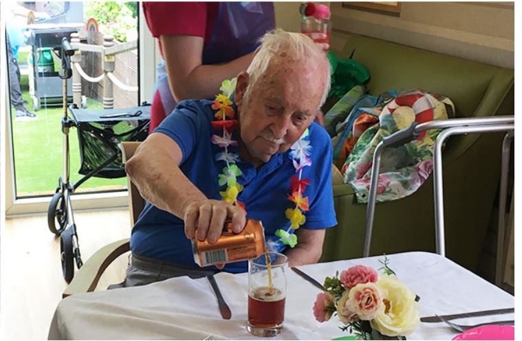
Our residents enjoying Caribbean BBQ food and drinks