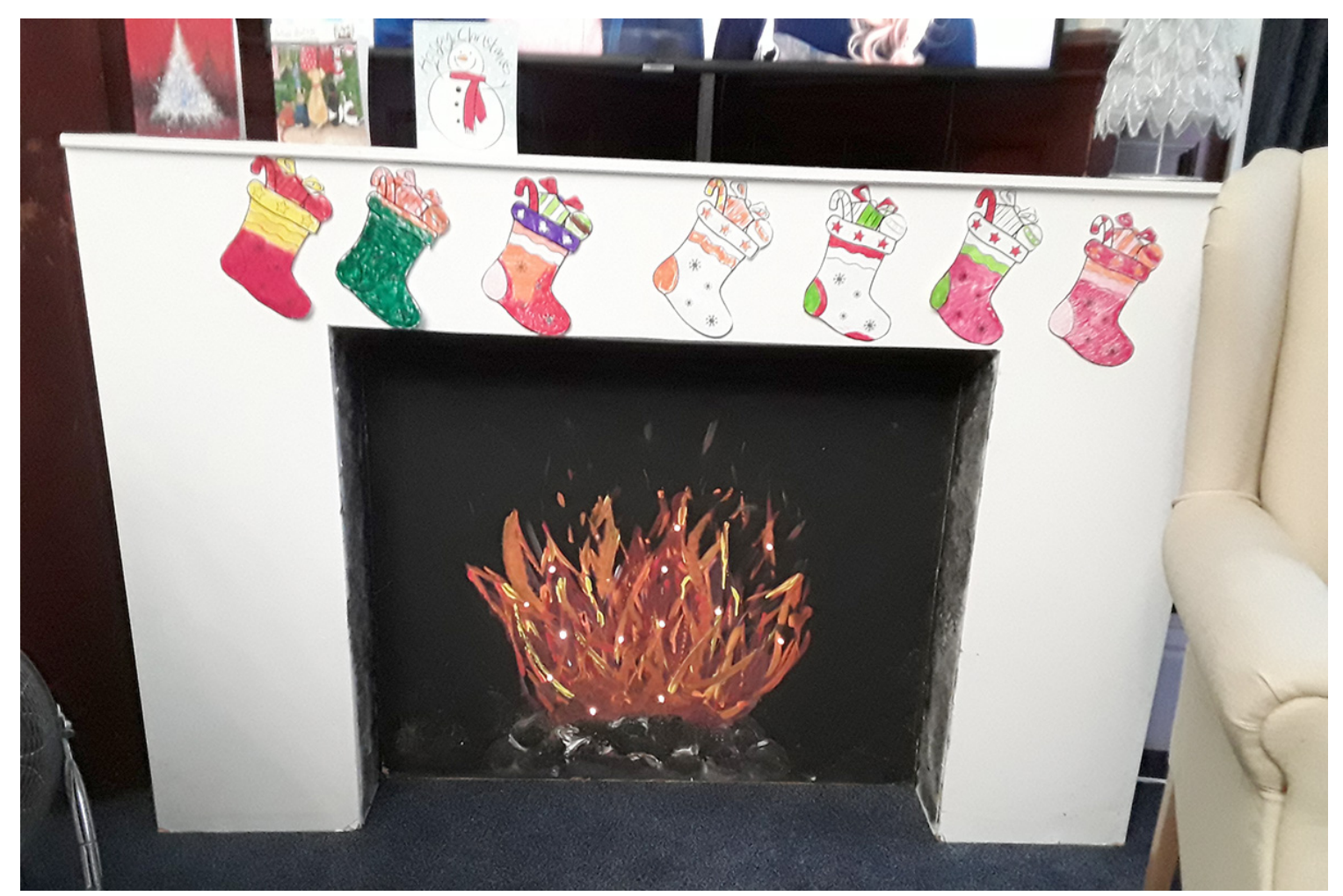
Don't the finished stockings look lovely!