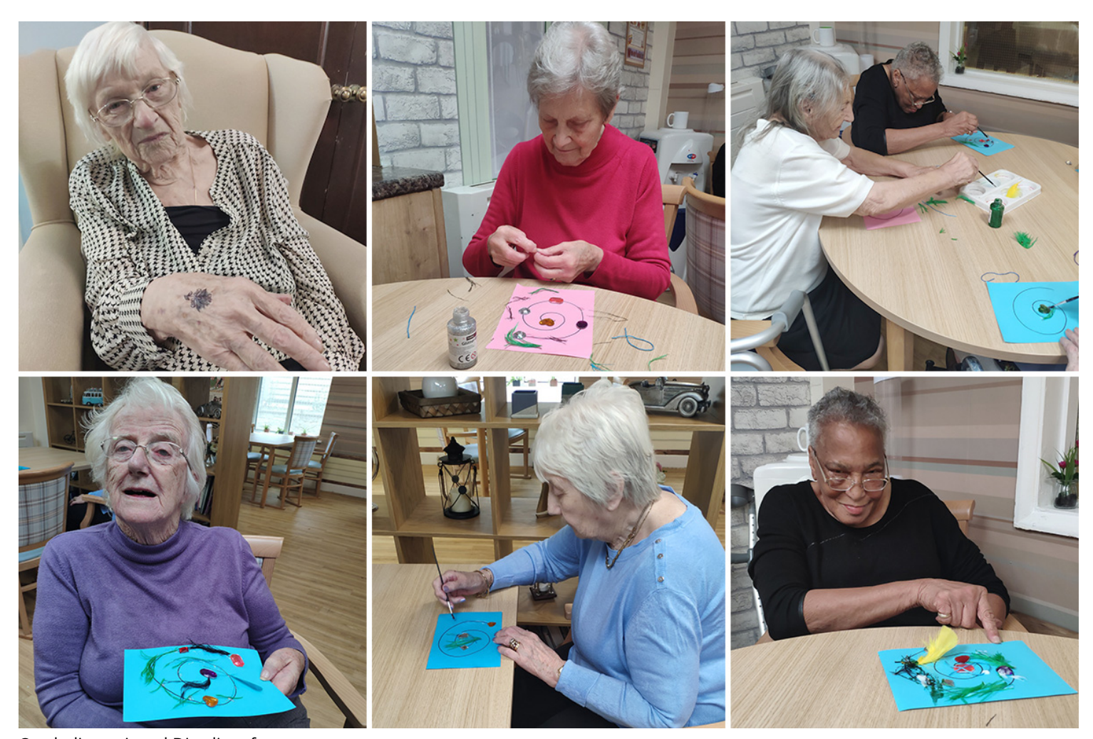
Our ladies enjoyed Diwali crafts