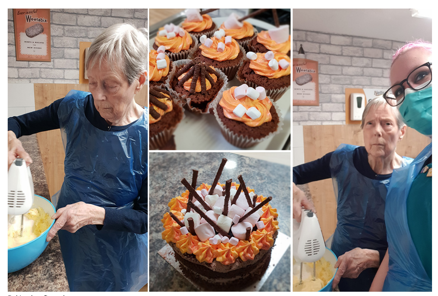
Baking bonfire cakes