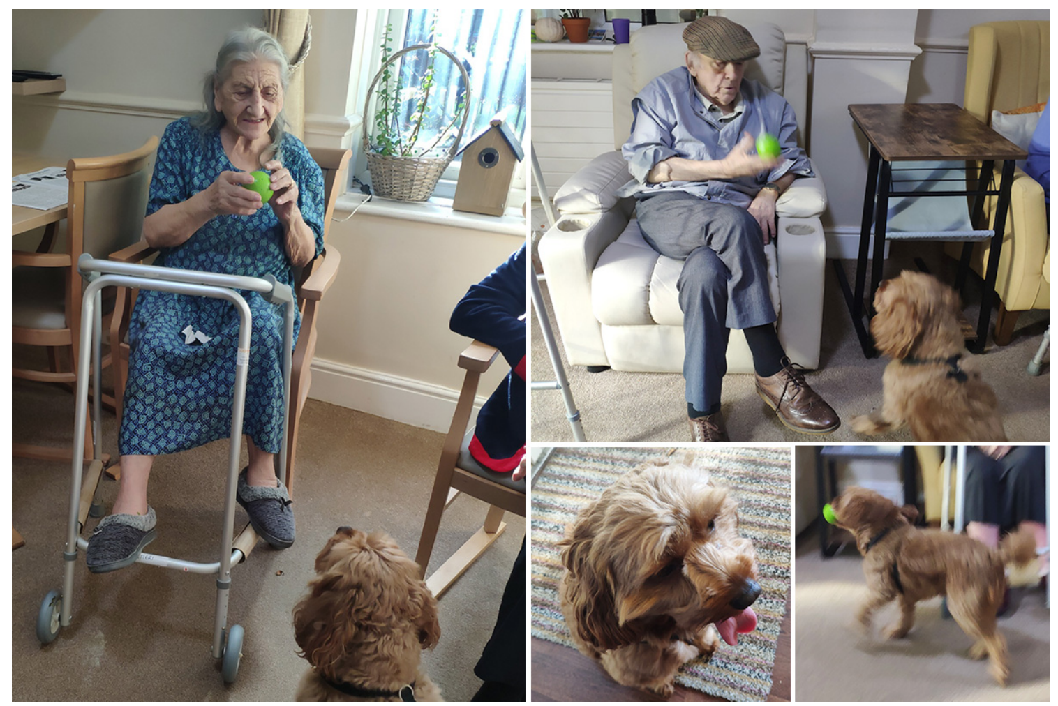
Ralph is lovely and very playful