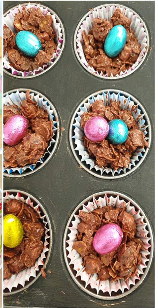
We had lots of yummy treats!